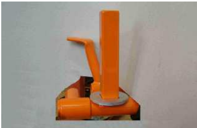
Foto of the frame from the side with the section of the support for the RTPS (Rear Tire Protection System)