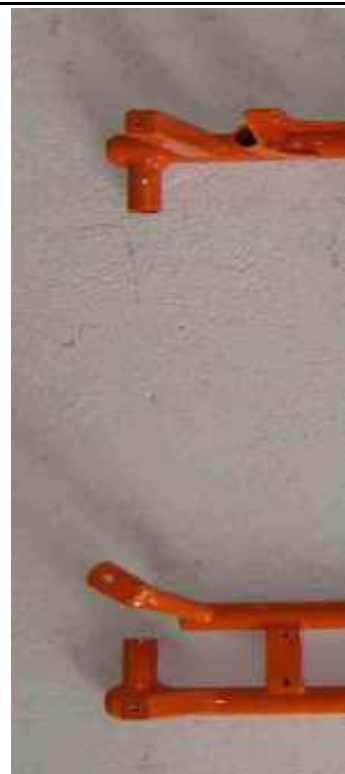
Foto from above of the frame with the section of the two supports for the RTPS (Rear Tire Protection System)