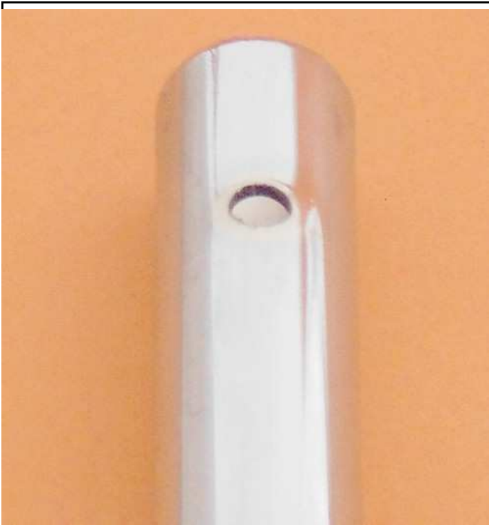
Foto from the steering column with the section with the knurling for the steering wheel hub (knurling according to DIN 82 - RAA1).