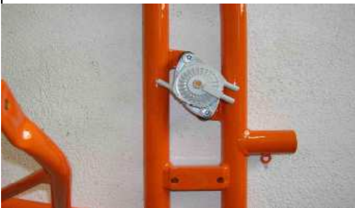
Foto of the frame with the section of the support for the fuel pump (fuel pump mounted)