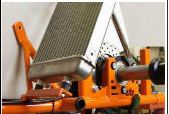
Foto of the frame from the side with the section of the supports for the radiator (radiator mounted)