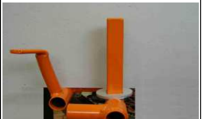
Foto of the frame from the back with the section of the support for the RTPS (Rear Tire Protection System)