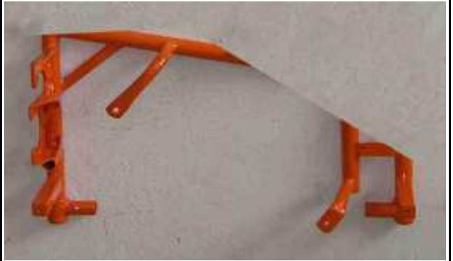
Foto from above of the frame with the section of the two supports for the exhaust system